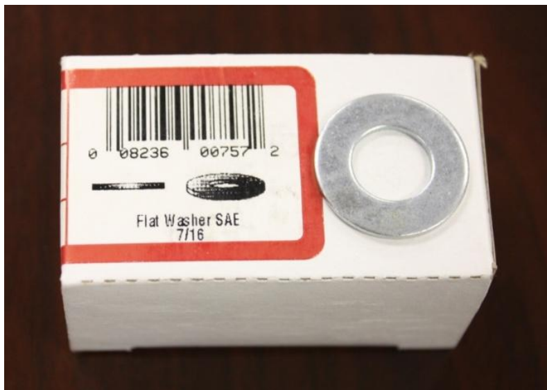
Figure 1—7/16" Flat Hardware Washer Billed at $196.50 for Package of 10

Source: Washer specifications, descriptions and unit of measure provided by AECOM officials. Photograph of like-kind washer provided by SIGIR.