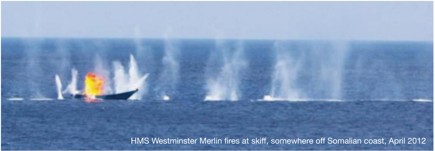
HMS Westminister Merlin fires at skiff, somewhere off Somalian coast, April 2012