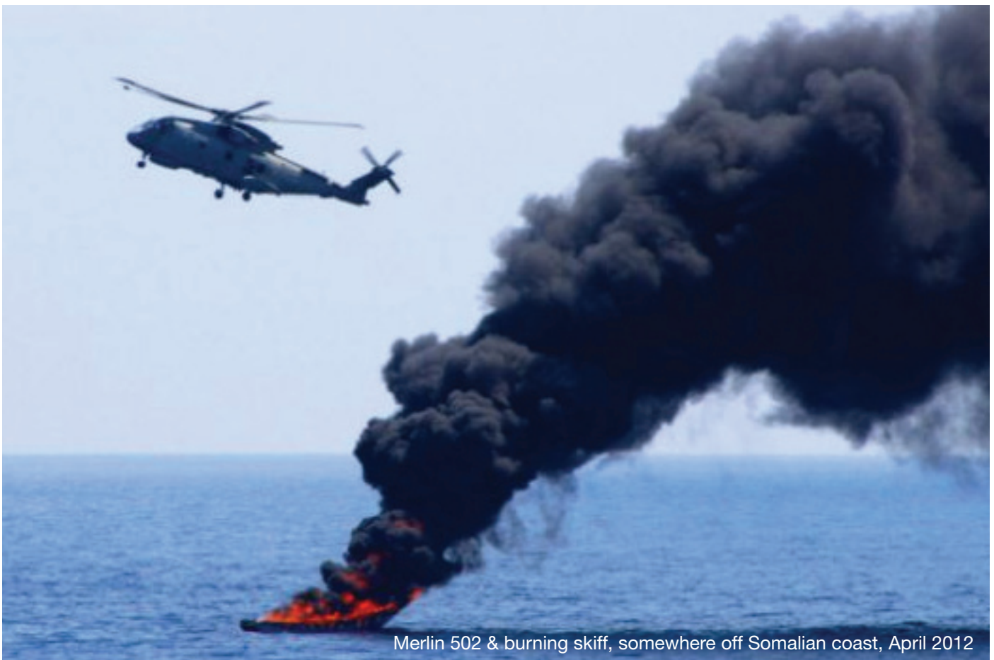
Merlin 502 & burning skiff, somewhere off Somalian coast, April 2012