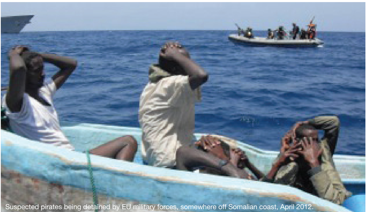
Suspected pirates being detained by EU military forces, somewhere off Somalian coast, April 2012.

Since the civil war in 1992, Somalia has suffered continued violence and many humanitarian disasters. Last year conflict and food shortages led to 2.5 million Somalis being internally and externally displaced. Such events can not be divorced from the ongoing militarisation of the country. Since the Cold War, billions of dollars worth of weapons were poured into Somalia and neighbouring countries by western governments who used warlords, militias and governments as proxies. The US-backed invasion of Somalia by Ethiopia attempted to displace the Islamic Courts Union in 2006. CIA black ops have been back working with warlords and renditioning individuals since 2003, followed by ongoing air assaults and bombing raids since January 2007. 15 The ongoing interventions by outside forces has contributed to the rise in piracy.